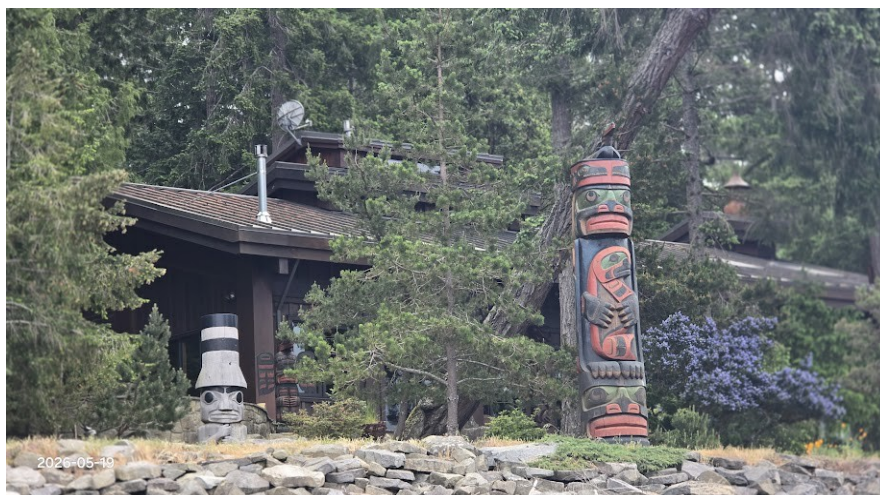
Totems on Jackscrew Island