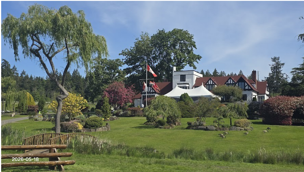
The main lodge at Capernwray