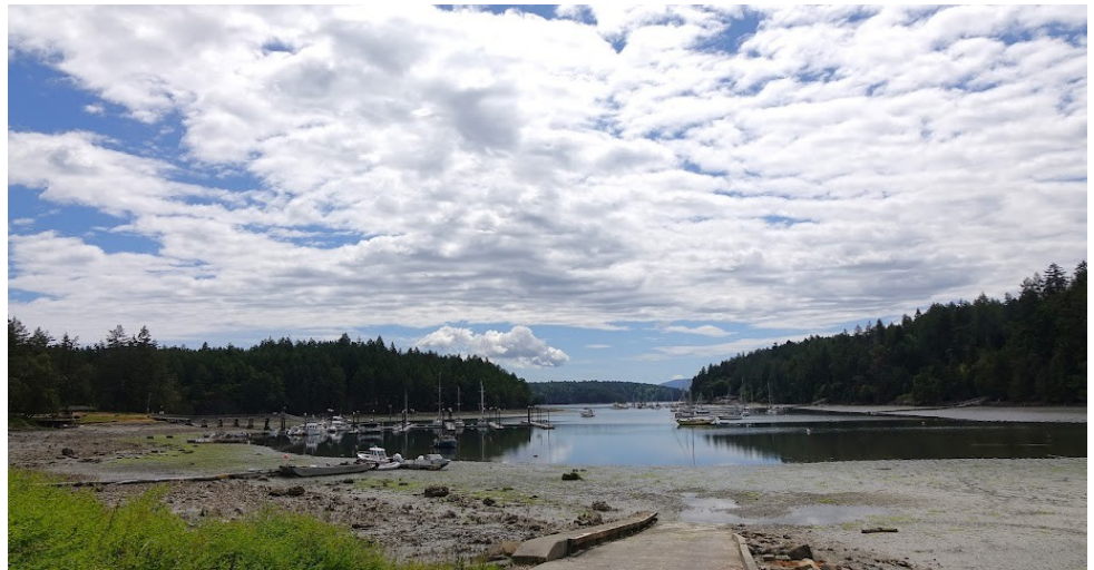
Padding thru the Cut in the morning, then a minus tide upon return