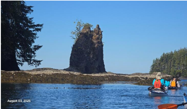
Dramatic sea stack rocks.