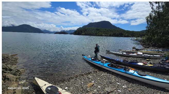
Lunch stop near Surprise Isl.