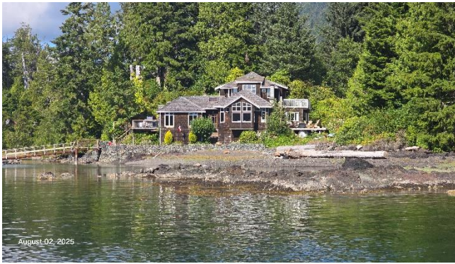
Sea Otter Lodge comes with dock, two decks, a kayak friendly beach, and walking trails.