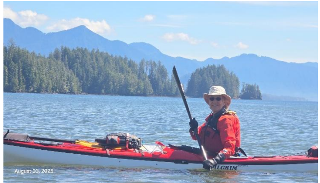
Dramatic scenery all around.