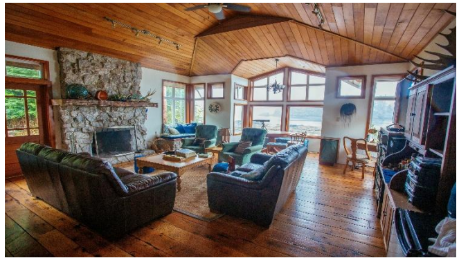
Sea Otter Lodge's spacious and comfy Great Room.