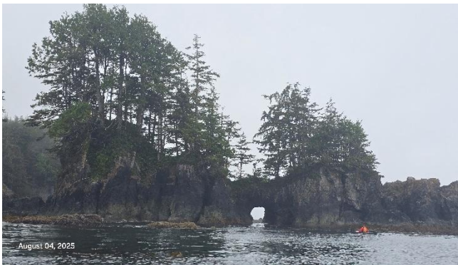
Surge was too rough to transit the cave.